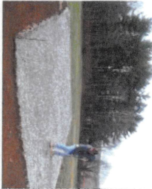
SITE PREP EXAMPLE